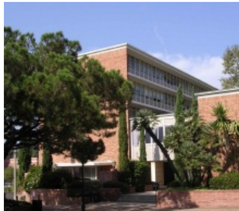
Rolfe Hall. Home of UCLA Emeriti/Reti ree Relations

UCLA was the first campus to form an emeriti association (1967) and the first to form an emeriti center (1969).